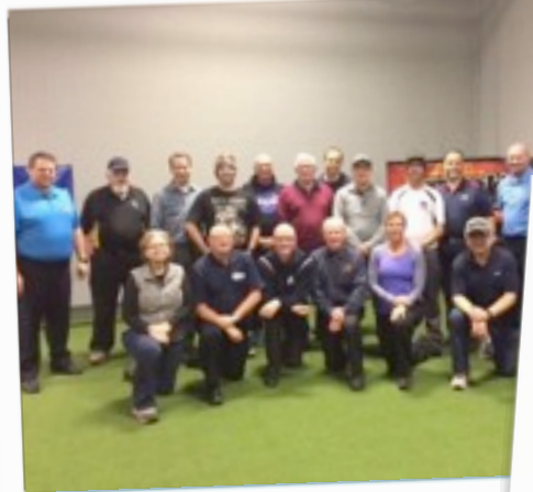
Attendees and Instructors of the first session of the Academy