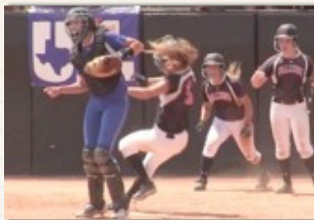
One of the plays we talked about where the umpires weren't paying attention to runners coming across the plate, and how important it is to always have the 4 elements in front of you