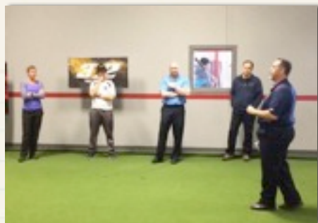
Setting up a drill for what to look for on potential Obstruction/Interference possibilities